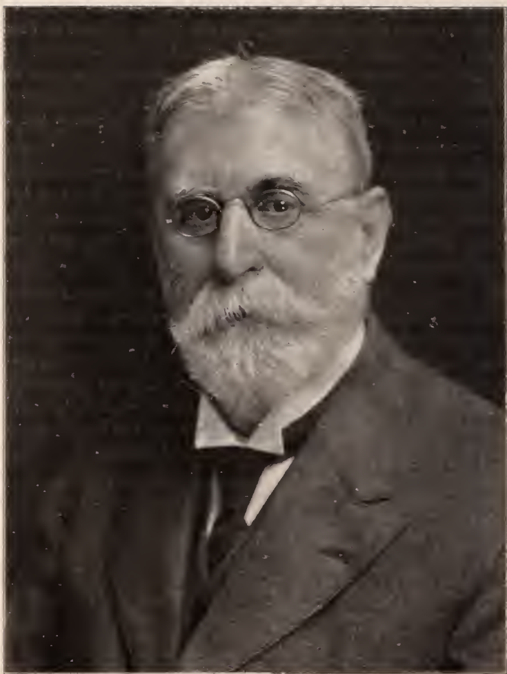
BENJAMIN BRECKINRIDGE WARFIELD, D.D., LL.D., Litt.D.